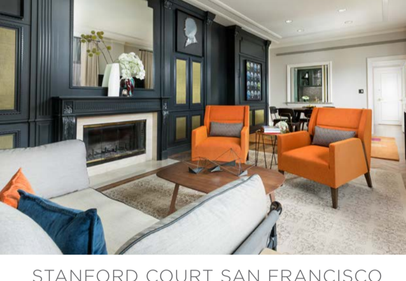
STANFORD COURT SAN FRANCISCO SAN FRANCISCO