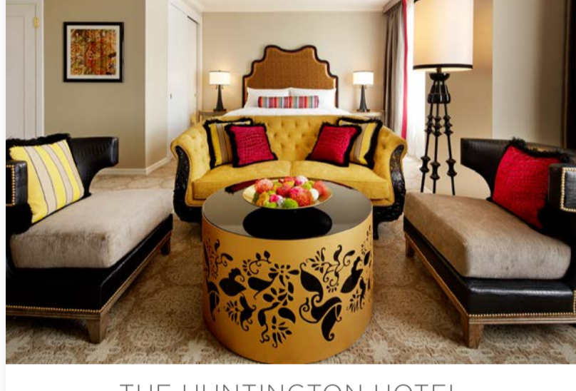
THE HUNTINGTON HOTEL SAN FRANCISCO