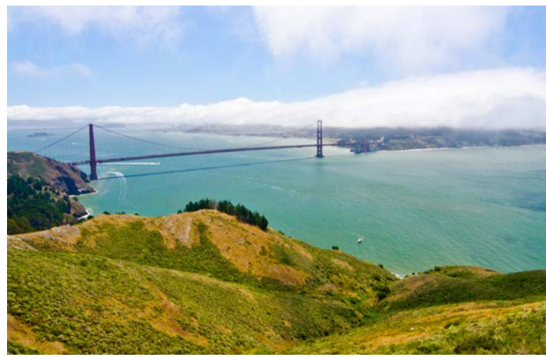
GOLDEN GATE NATIONAL RECREATION AREA