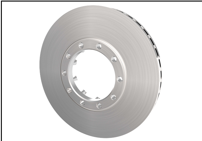
ConMet 10084701 Flat Rotor

Service Kit Part Number 10085621 ConMet Flat Rotor 10084701 Rotor Minimum Thickness 1.46" (37mm)