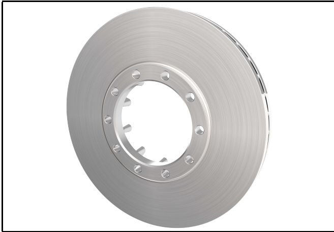
ConMet 10034621 Flat Rotor

Service Kit Part Number 10041216 ConMet FF-Front Flat Rotor 10034621 Rotor Minimum Thickness 1.46" (37 mm)