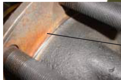
Drum shaving as a result of mismounting.