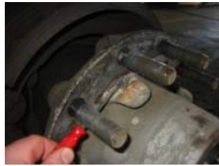
Rust and corrosion build-up.

Adhering to simple procedures in mounting, inspecting, and servicing your ConMet brake drums will help you prevent early failure and ensure long life. While our Service Manuals describe in detail the reinstallation of brake drums and wheels, the guidelines below will reiterate the information in the manual and provide helpful tips. One of the most common causes of brake drum failure is cracking (see photograph at right). And the most common cause of cracking is improper mounting. Mismounting can shave or crush the pilot (see picture at right), which can lead to the drum cracking cross flange through a bolt hole. Another cause of drum malfunction is the failure to remove the build up of rust and corrosion in and around the studs and pilots before reinstallation of the brake drum. In both cases, the drum does not fully seat against the hub flange. The gap between the drum flange and the hub flange will cause high bending stresses, which is how brake drum flanges crack through bolt holes. Other important things to remember to prevent drum failure: