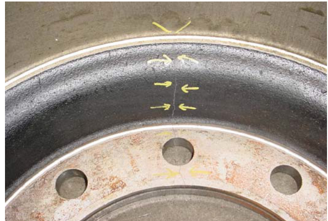
Example of drum cracking.