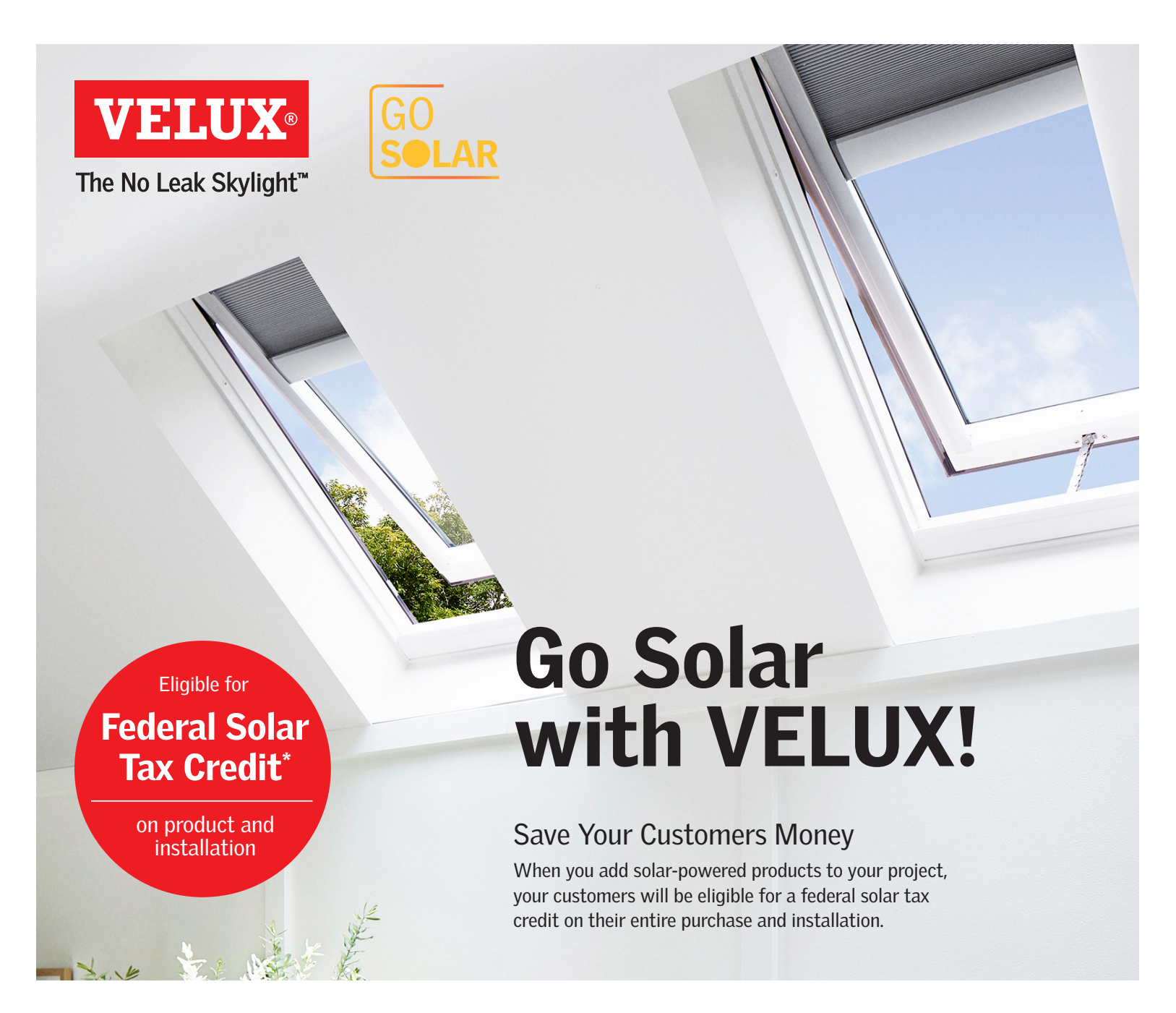
Solar Powered "Fresh Air" Skylight