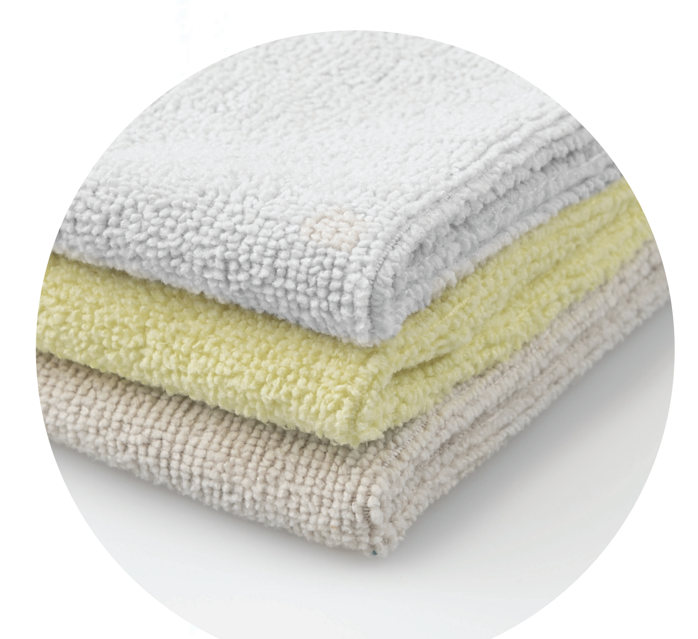
2003 Face and Body Pack offers skinloving comfort.