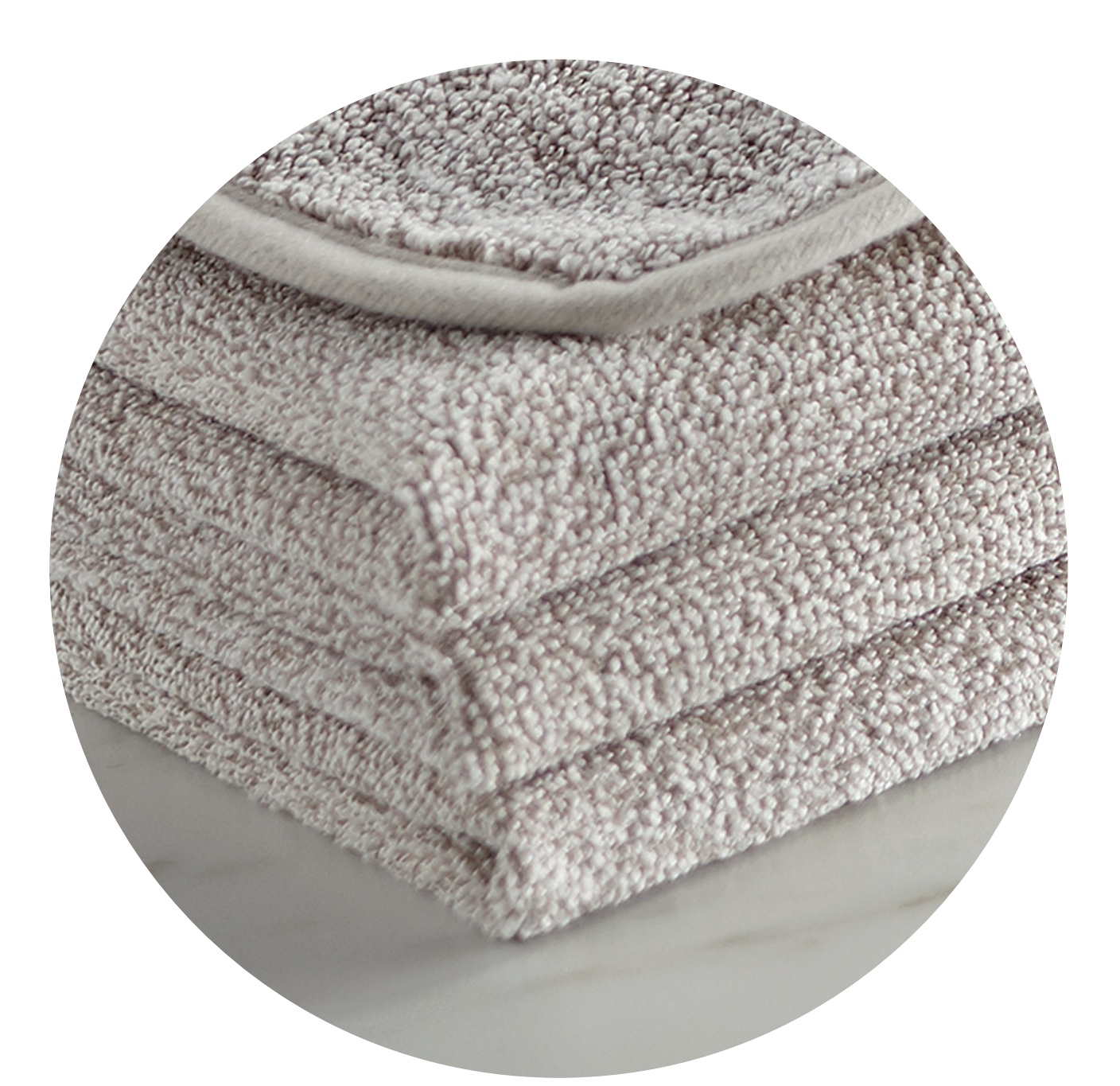
2020 Ultra-Plush Body and Face Pack combines luxury and convenience.