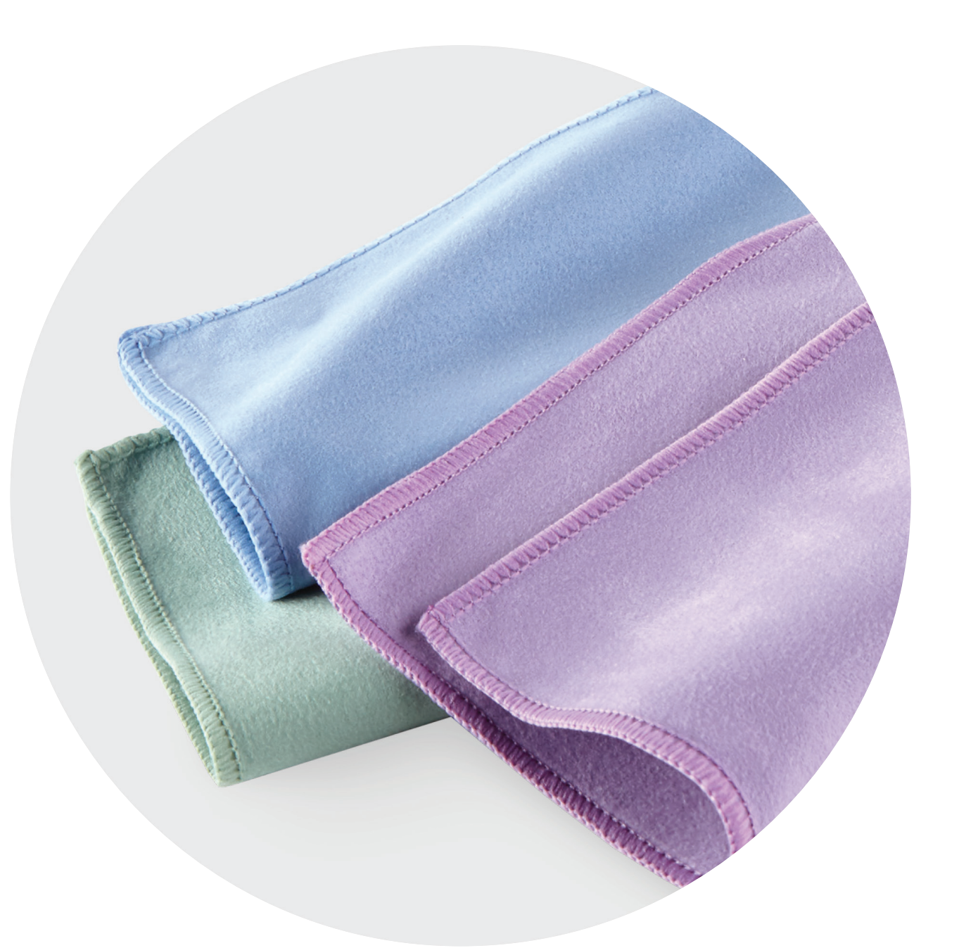
2011 Makeup Removal Cloth Set effortlessly removes makeup without any soap.