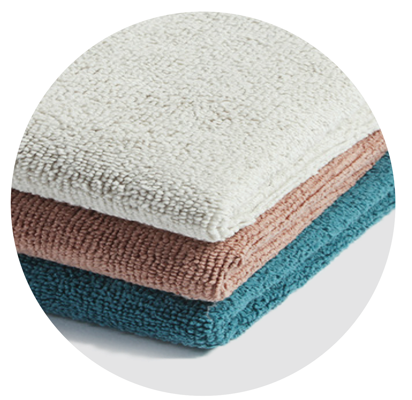
2017 BacLock® micro-silver agent is introduced, protecting the cloth between washes.<sup>1</sup>