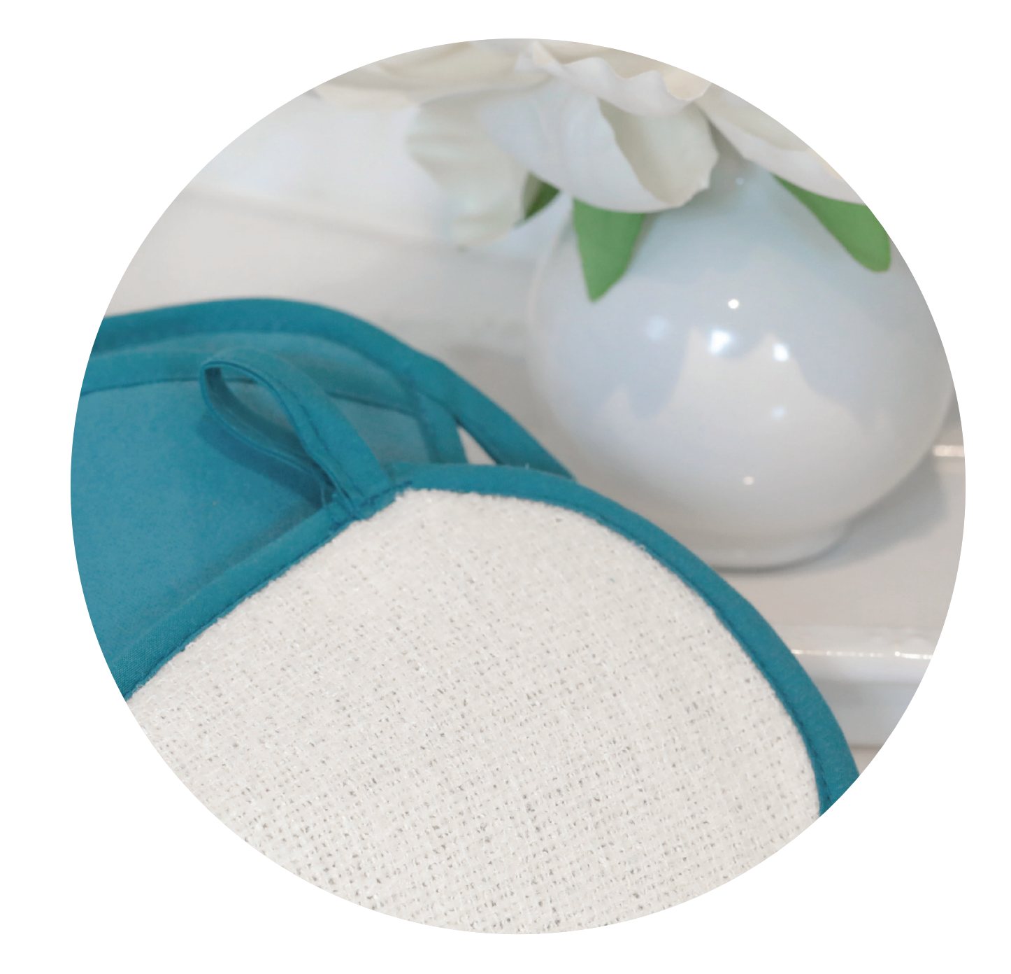
2020 Exfoliating Facial Mitt whisks away dead skin cells to leave your face feeling renewed.