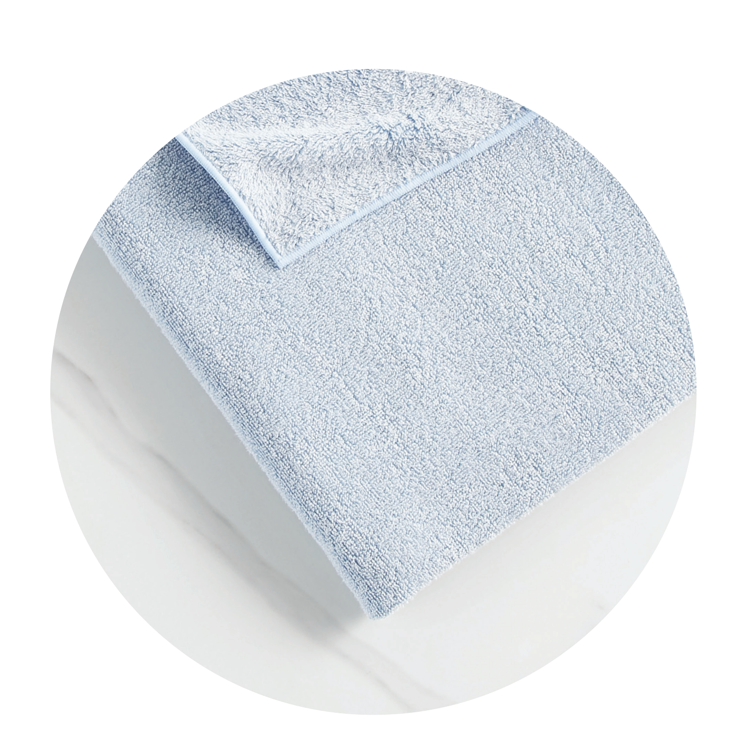
2024 Limited-edition Lyocell Microfiber Plush Body and Face Pack creates a luxurious experience.

<sup>1</sup> BacLock is an antimicrobial agent solely intended to protect and self-clean the cloth by inhibiting growth of odour-causing bacteria, mould and mildew. BacLock does not protect people from disease-causing pathogens.