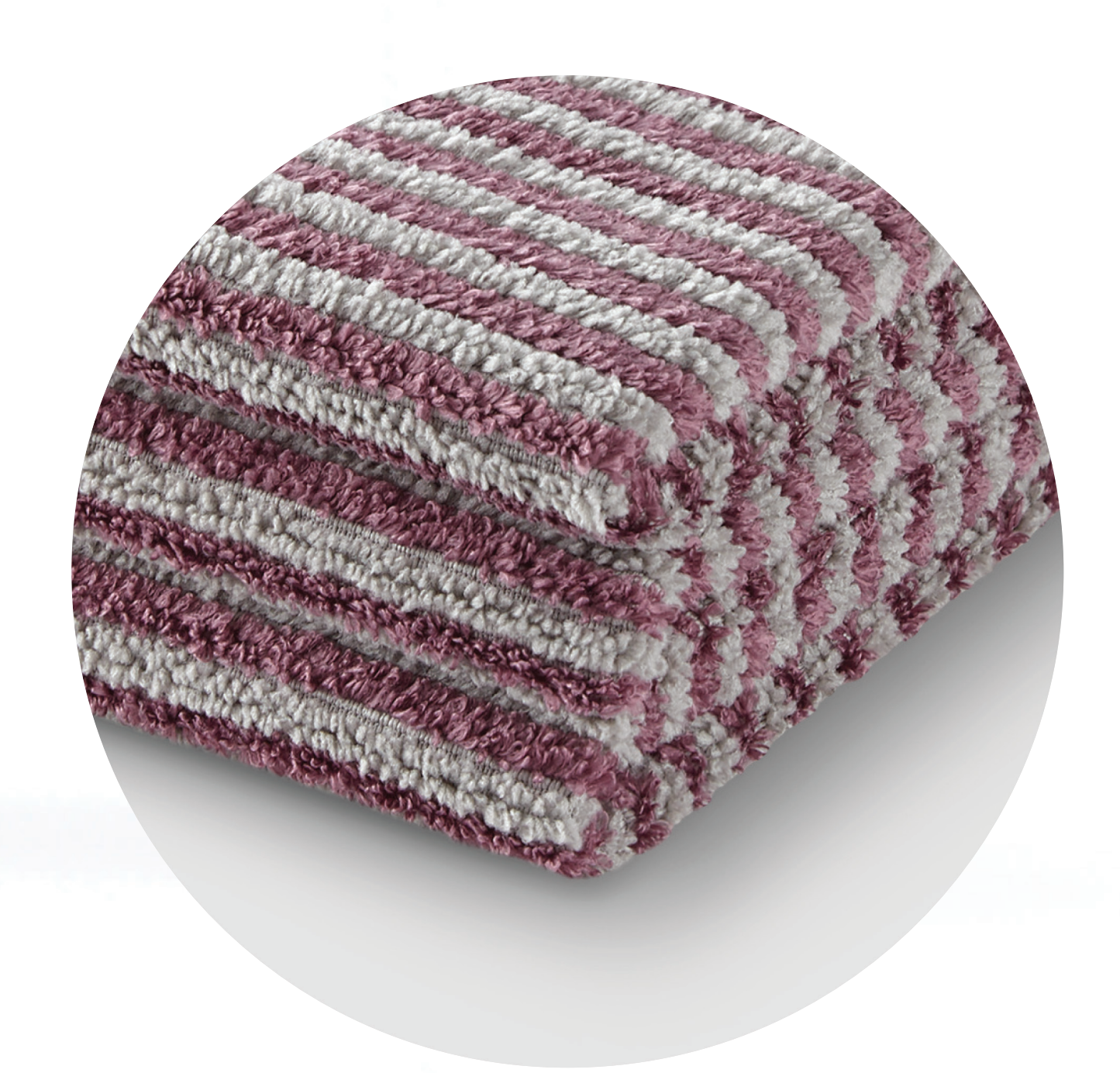
2022 Body and Face Pack gently cleanses your skin using only water.