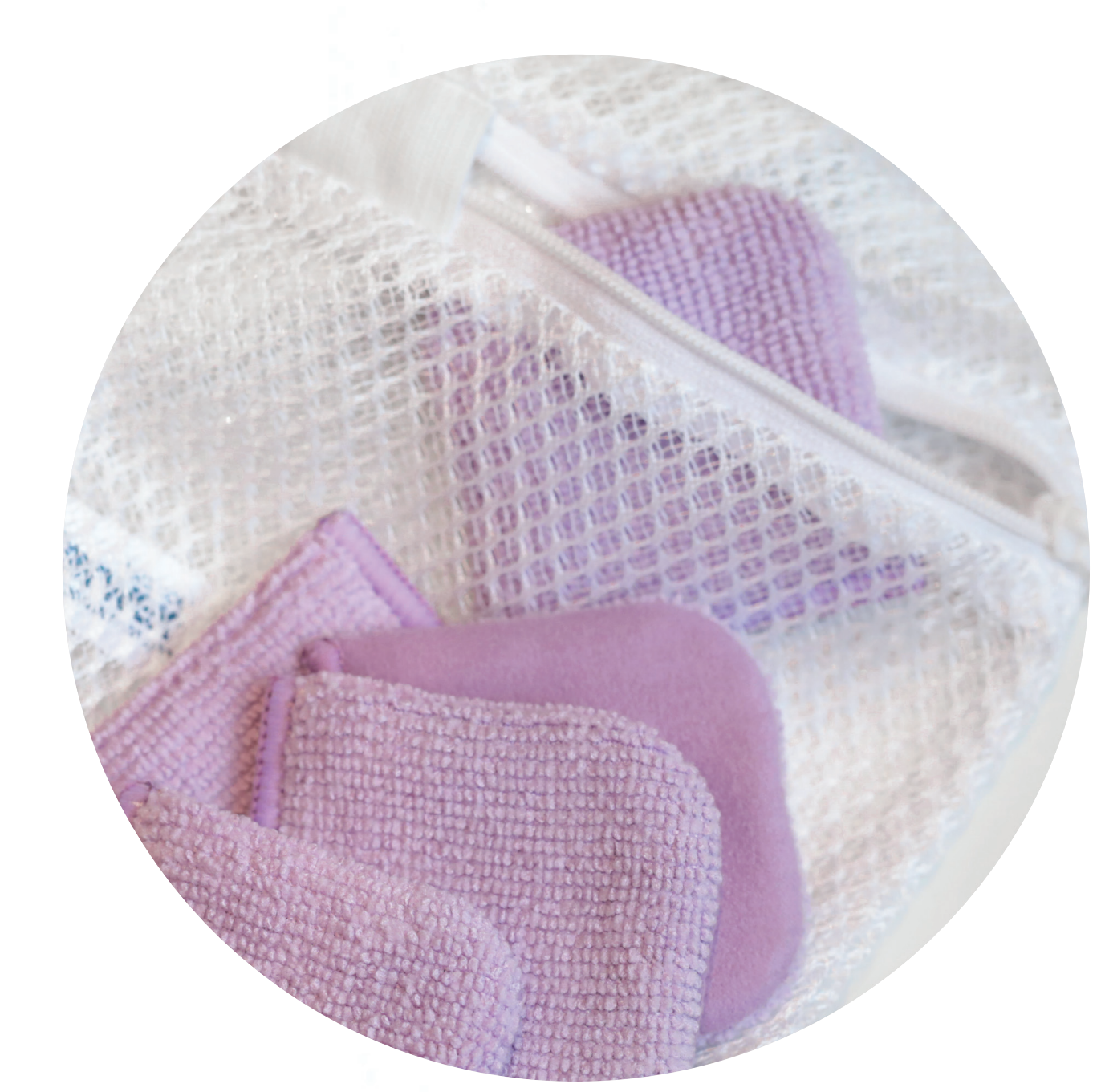
2019 Facial Pads replace cotton balls and single-use pads.