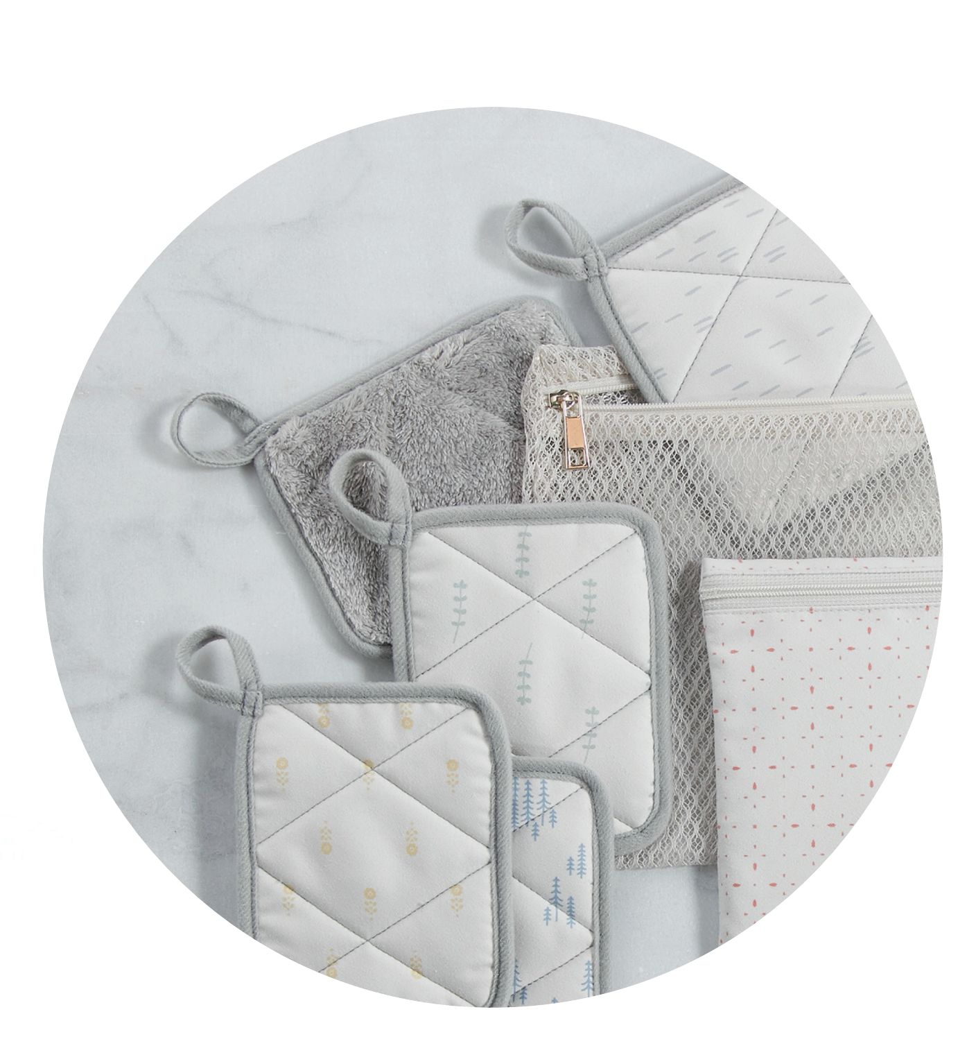
2023 Dual-Sided Makeup Removers remove makeup with water alone.