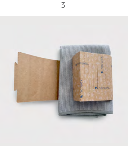
Fold over right slotted side and fold under excess length.