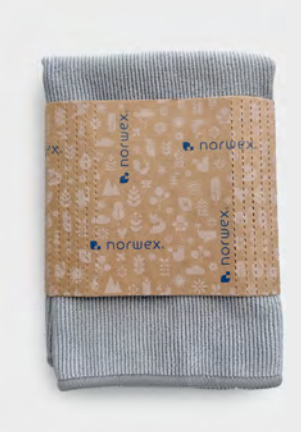
Ready to present to your customers!