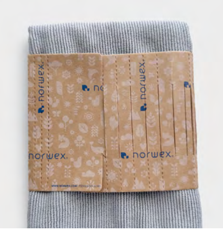
Slide into place until sleeve fits snug and locks in place.