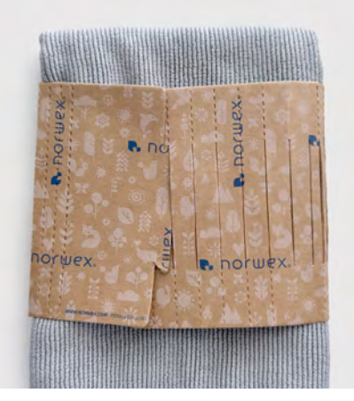
Fold over left side and insert notch into best fitted slot.