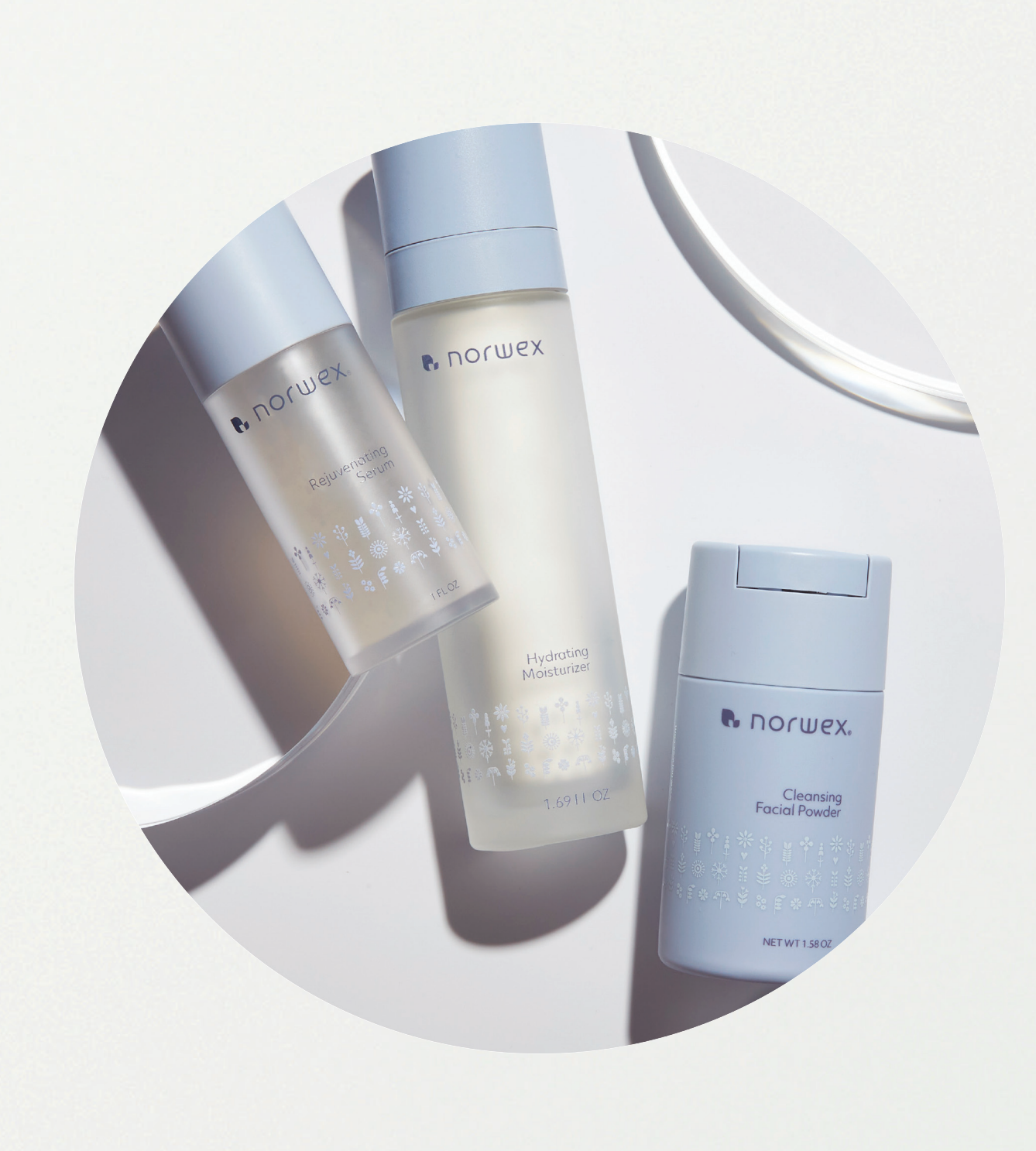
2023 Norwex Skin Care introduces refillable packaging and refined formulas featuring Nordic antioxidants.