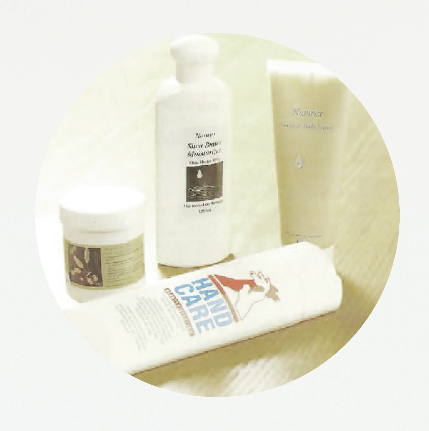
2004 Facial Lotion nourishes with vitamin E and collagen.

Reducing harmful chemicals in everyday lives starts right where you are, with the skin you live in.