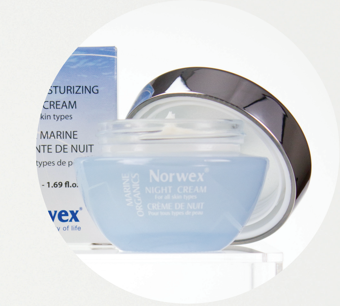
2012 Naturally Timeless Collection uses the power of nature to combat the appearance of aging.