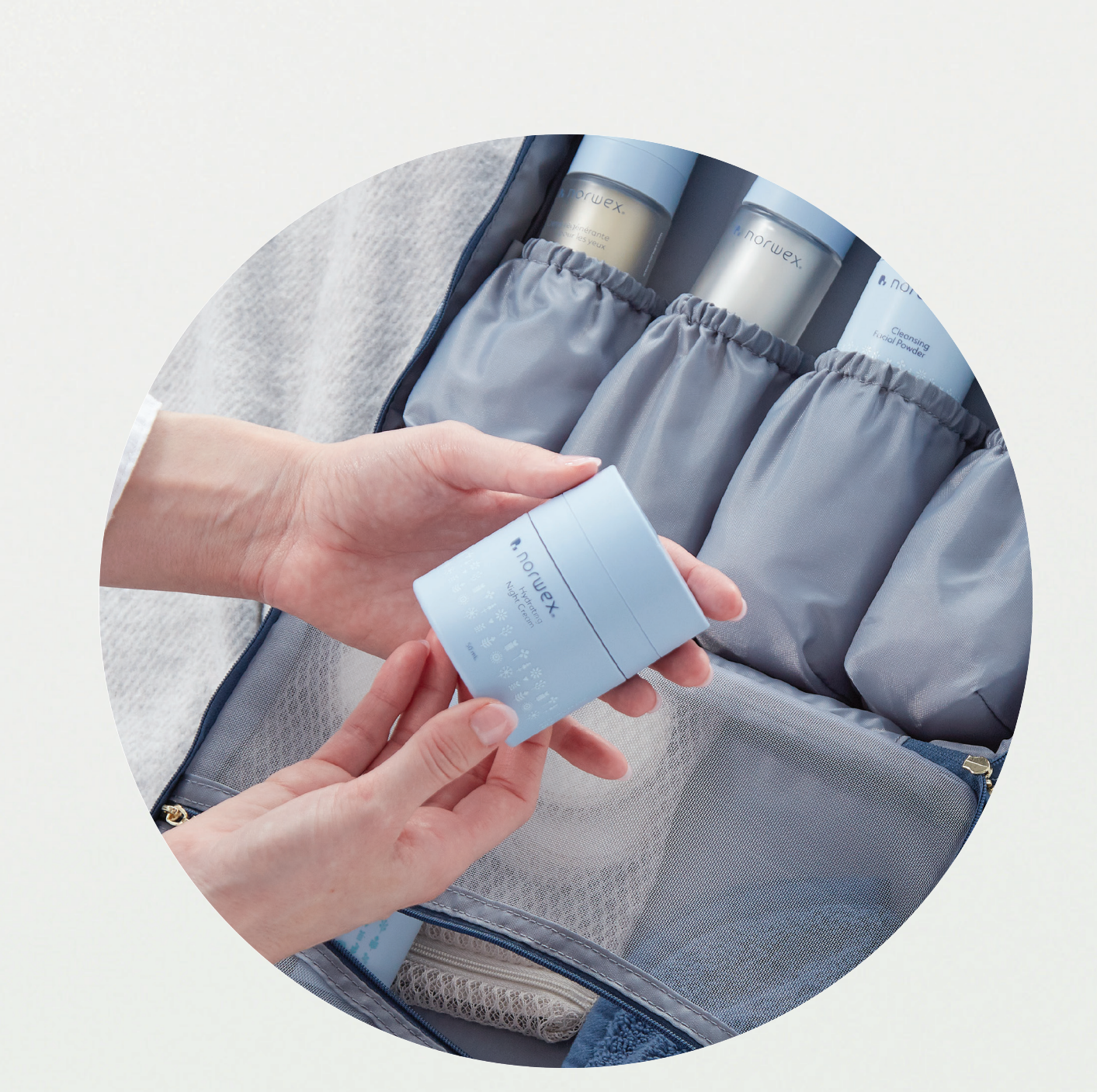
Hydrating Night Cream and Carryall Travel Bags expand our personal care line.