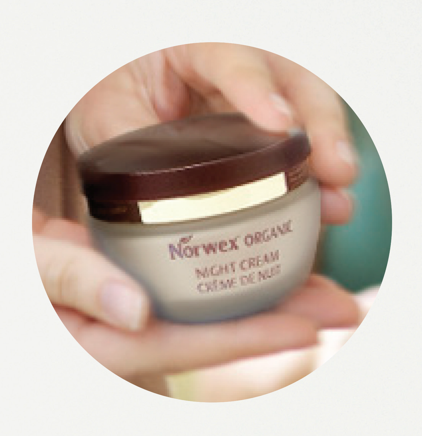
2009 Organic Swiss Alps Night Cream deeply moisturizes.