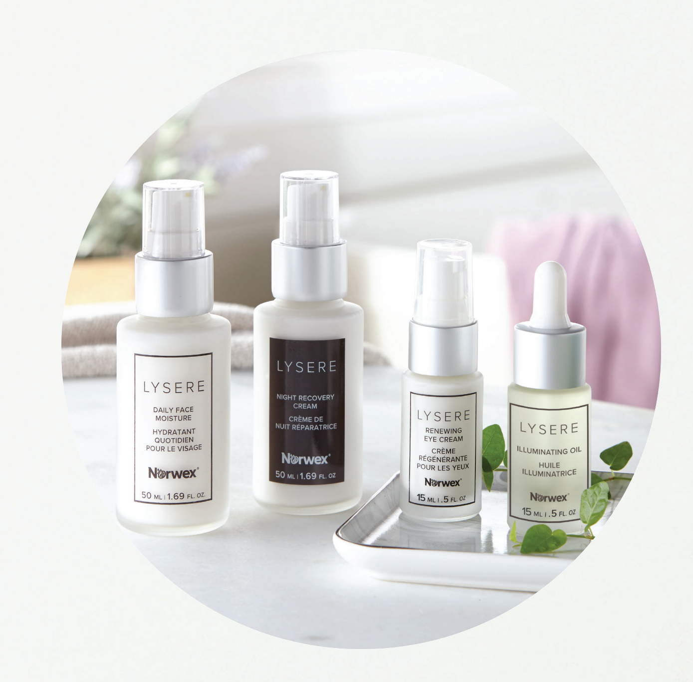
2020 Lysere™ Skin Care Collection brings out your inner glow with clean, Nordic ingredients.