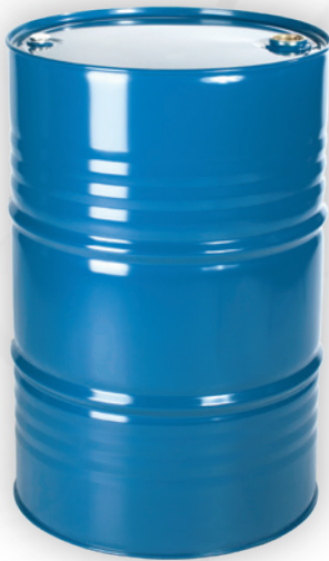
for Tight Head drums