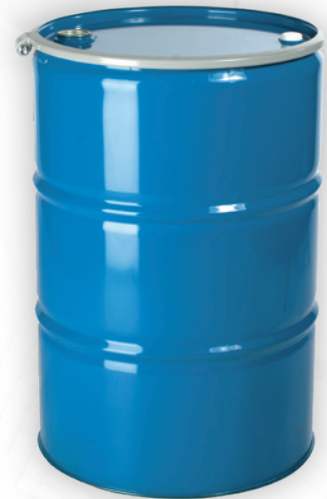
for Open Head drums