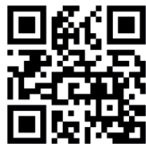
RETAILER PARKING PERMIT ^SCAN HERE^